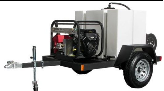
Optional transport trailer or tank skids include inlet hose, stainless inlet and high pressure hose reels, bulk water tank and is factory assembled.